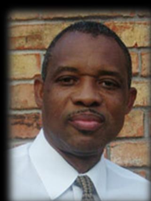
Dr. Floyd Atkins Center of Wellness and Healing Houston, Texas