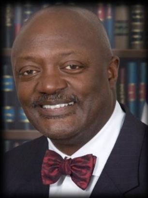
Judge Morris L. Overstreet Texas State Court of Criminal Appeals Amarillo, Texas